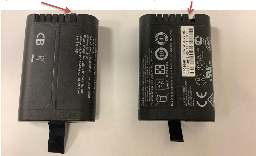
Old RRC battery without insert